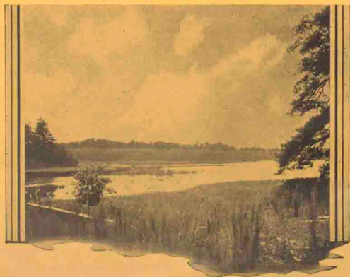
Broadside 1922 H5772

STILL, so long as a primitive love of nature stirs in the children of men, and the legends of a simple people touch the heart strings, and the sight of the homes of your forefathers quickens the pulse, you will follow the woodland trails where the sunlight flashed on helmet and breast-plate of the adventurous Captain over 300 years ago!