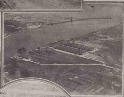
Del-Mar-Va affords manufacturers, large or small, coordinated road, rail, river and ocean transportation facilities