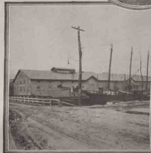
High grade garden and farm fertilizers are produced in large quantities