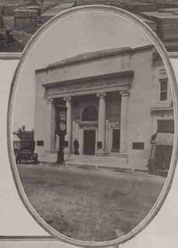
Many new bank and business structures reflect prosperity on the Peninsula