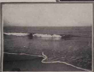
Eighty miles of Atlantic Ocean beach line skirt the Eastern Shore