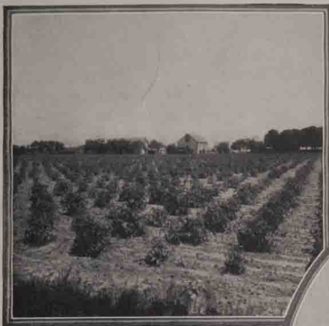
One of Del-Mar-Va's many historic estates

The Del-Mar-Va section ships more than one third of the world's supply of canned tomatoes.